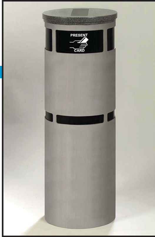
Canister Style Optical Turnstile