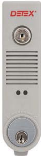
Shown with mortise cylinder (cylinder sold separately - add xMC65 to order the ES300 with mortise cylinder)