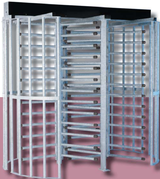
DS400 Series Tandem