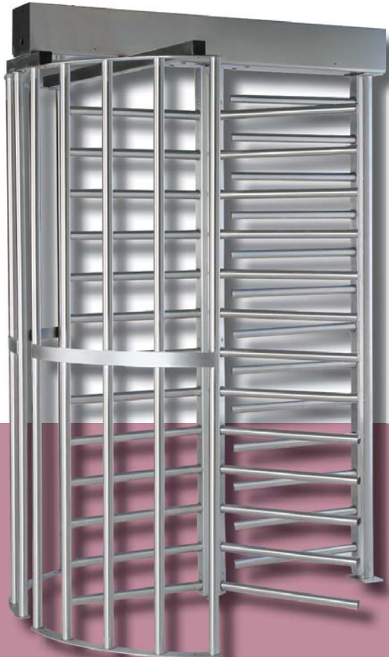
DS400 Series Single